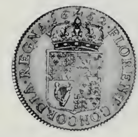
Lot No. 2862

Charles II, 1660-1685. Pattern Broad (20 Shillings), 1662. Obv. Laureate peruked and cuirassed bust, l. There is a faint "S" below the truncation. Rv. Crowned Arms, date above and inscription FLOR-ENT CONCORDIA REGNA around. North 2780, Brooke Pl.LX,3. Very Fine. (1,750-2,250)